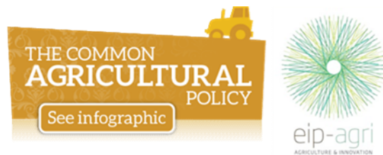
CAP & EIP-AGRI