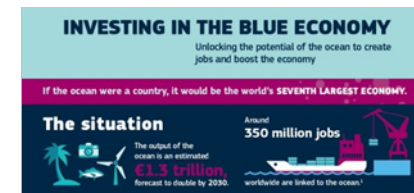
Integrated Maritime and common fisheries policies